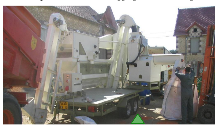
REVOLVING SEED TREATER